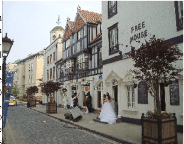
Fig. 13 : Street scene with wedding couple, Taiwushi, Shanghai.

The neighbourhoods are then cleanly severed, gated and equipped with the typical security infrastructure. ‘Thames Town’ is complete ? the travesty of a Chinese city.