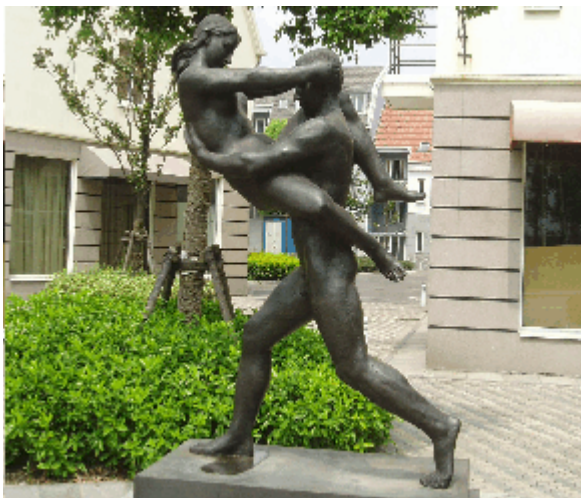
Fig. 17 : Nudity as brand identity, Luodian, Shanghai.

The Nordic style can be recognized most of all by the emblematic use of curb roofs. Here and there, these have been amended with pitched roofs, hipped roofs, and others, mostly extrapolated forms of curb and hipped roofs. The placement of bronze sculptures depicting nude men, women, and children is obviously considered a further symbol of Nordic culture. Nude people become a brand symbol of Luodian simply by their abundance. Obviously, Scandinavia or Sweden is intended to be associated with the nudist culture ? or maybe it is associated with it anyway ( ?). In any case, a large sauna has opened business in the city centre. At the time of the site visit however it looked orphaned, was closed, and the colours of advertising signs had started to fade.