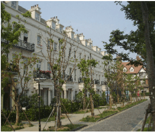
Fig. 14 : Victorian style residential fiction located at a 'square' in Taiwushi, Shanghai.

In other words : We find in its pure form all that is diluted in Anting New Town, under the auspices of modern Germany and the search for compromise with the Chinese spatial requirements. Thus, Taiwushi New Town appears to be an urban copy of elevated quality, no holds barred. Not a real city, yet a built dream, gripping powerfully into the imagination of the Chinese. And so it is absolutely not surprising that Thames Town has become an El Dorado of the immense Shanghai wedding industry. The pseudo-public spaces surrounding the square at the cathedral have been almost completely occupied by their cosmetics-, photo-, video-, and dressing studios. On a nice day, one can see dozens of wedding couples at once, the bride in her flowing white, beige, or pink dress, the groom occasionally with a British top hat on his head or in his hand, sometimes couples in horse drawn carriages clattering along the cobblestones of the alleys. Just like in a fairy tale !