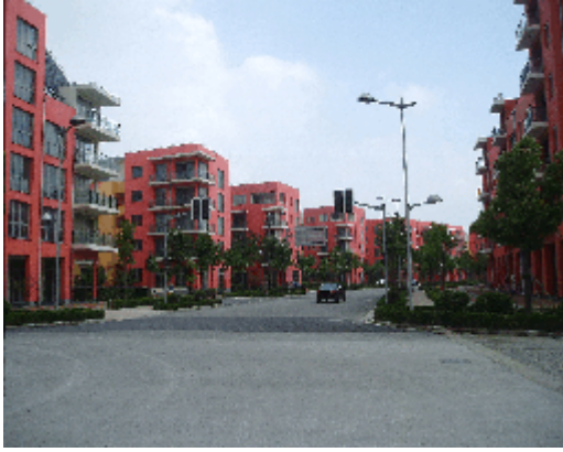
Fig. 11 : ‘German city’ ? with row-ends facing the street ?

As observed in detail, Anting is a project threatened by failure ? this conclusion is valid at least for the current shape of implementation (June 2007). The process of this failure can be imagined as a chain of compromises that pour salt into the wound rather than heal it : The neighbourhoods can’t be closed off anymore, so this is accomplished by use of symbolic actions such as miniaturization. The central urban place needs to be open in order to create a functioning retail area. This is however not possible if there are no closed neighbourhoods. The elongation of blocks limits existing creative space for the design of neighbourhood courtyards. Is the block border maintained, the orientation rule is violated. If the still existing open places are re-coded into neighbourhood courtyards by subsequent means of closing them off, a communitization of their public (social) character takes place ? a risky kind of intimization of spaces with meaning for creating the identity of Anting New Town as a whole.