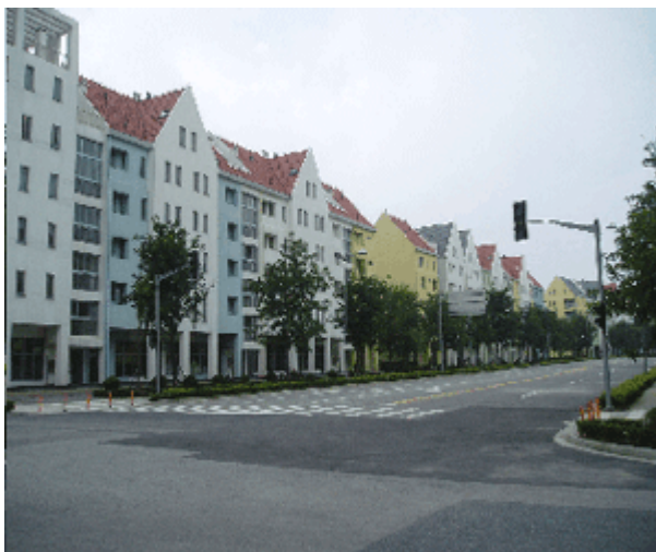
Fig. 2 : Residential buildings with commercial ground floor use and featureless gable end facades.

A first glance at both the original models as also the part of the city that has been completed until today in the first (German) construction phase displays these characteristics more or less clearly : There is a central place with a church and larger buildings for public and commercial use. There is block border construction with vertically oriented buildings featuring pitched and hipped roofs, curved streets, gable end facades and a bordering by a kind of moat or trench. Also, the noticeably colourful character ? the buildings are painted in red, yellow, ochre, and blue hues ? cites the colourful character of the European city of times past.