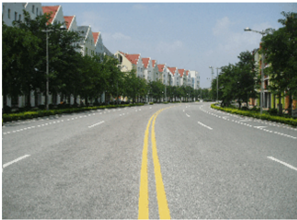
Fig. 4 : Excessively broad, curved street in the centre of the 'European' city Anting.

The southern orientation was known and has been incorporated in the transposition of the idea of the German city to China. However, its meaning has been underestimated. Only during the course of developing the project the significance of this aspect became obvious to the planning actors, which in part led to drastic adjustments. The Shanghai planning and building code may have played a role here. In compliance to obviously deeply rooted daily cultural practices, variances are not permitted without special permission. The city finally conceded to permitting a variance covering 30% of the residential construction (Cai/Bo 2004, 74).