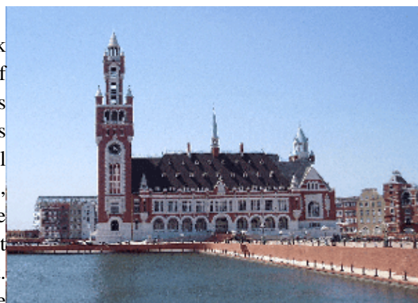
Fig. 19 : Staged building copy from Amsterdam

Coming to New Amsterdam, visitors walk through large, unguarded gates. The windows of most of the buildings seem blind, the colours have lost their hue, and here and there, rust spots can be seen. Even complete street facades feel like Hollywood movie backdrops. In some areas, half-finished buildings stand within extensive voids and unused areas. Only few people inhabit the streets and places, gleaming in the sunlight. The only vivid area is the place in front of the central train station, from which no one departs