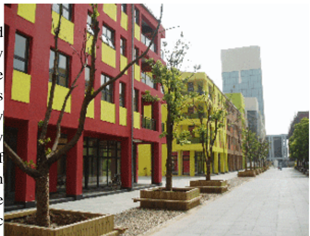
Fig. 3 : Residential buildings with commercial ground floor use.

What happened ? Why does the transposed structure lack graphic quality so much ? Why isn't there even a faint impression of the character of German town centres in Anting ? Is this due to the fact that Albert Speer actually intended to build a modern German town, a city that he would design that way in Germany (if someone could still build cities like that in Germany) ? Or is this just due to the fact that the plan, even though paying reverence to an archaic basic structure, has been covered with a modern infill structure ? Has Anting New Town, as a German small town, fallen victim to the Shanghai building code ? Or is Anting simply still too new, not vivid enough, has simply not been appropriated enough by its inhabitants ?