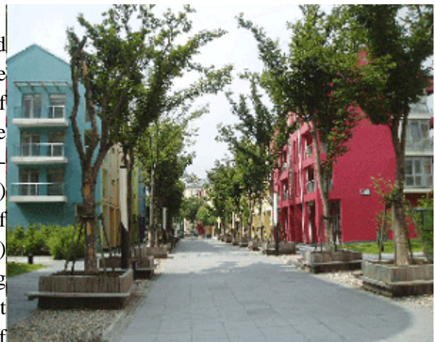
Fig. 12 : Pedestrian avenue with mixed use buildings, Anting.

Despite the criticism, the positive intentions and most of all the accomplishments of those responsible shall not be overlooked. The list of accomplishments begins with providing the dialogue between West and East (or the German-Chinese exchange of thought and experience) with an invaluable object of experience (of which, last but not least, this essay may profit) by creating the real-time experiment of Anting New Town. Dealing with this experiment provided enabling a heightened precision of intercultural awareness and furthering knowledge of the urban code of China. The fact that the project has and still proceeds to provoke a huge wave of secondary literature, books, essays, newspaper articles, blogs, etc. shows that this is not only limited to us. This is however only one aspect.