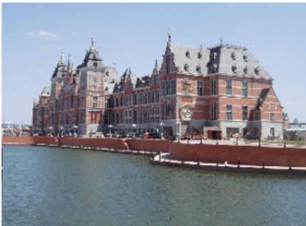
Fig. 20 : Copy of Amsterdam central train station in Shenyang.

New Amsterdam is a city collage. The images however were not collected from throughout the entire Netherlands and compiled into one plan. Instead, planners served themselves from the architectural richness of the famous Dutch metropolis of canals. Similar to Taiwushi or Luodian, a distinction was made between a residential area and a commercial area. However, the borders have been drawn less clearly here. The urban syntax of open and closed is not clearly visible ? and this is where, albeit distant, parallels to Anting lie.