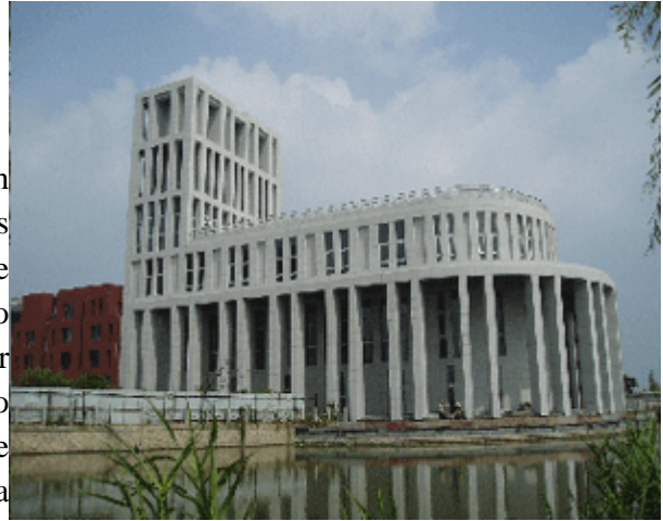
Fig. 9 : Anting Church (under construction).

In Anting New Town, according to the German ideal of the open city, no gated neighbourhoods were intended within the area enclosed by the symbolic moat. As result, there was no opportunity to take into account the necessity for introverted spaces. However, there is no alternative ! And so, adjustments were necessary. The opportunity was provided by a kind of emergency program to re-code the interior courtyards created by the urban block periphery into neighbourhood courtyards.