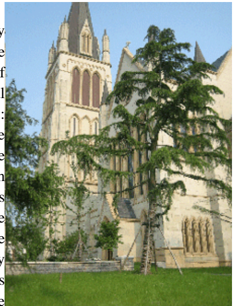
Fig. 15 : Copy of a cathedral, Taiwushi.