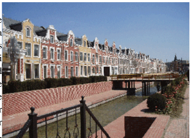
Fig. 21 : Fictional canal estates in Shenyang.

Nothing is definite in New Amsterdam. The main entrance appears as gateway to a neighbourhood. However, this area presents itself as a theme city in the style of the Shanghai New Towns. The entire urban space is designed as a closed space. In principle, the areas that are staged openly are, as result, also closed. On the other hand, the city is segmented into a number of neighbourhoods, among them mansion or horizontal areas, high rise or vertical areas, multiple areas (in the vein of step-by-step development), and not to be forgotten, residential buildings ? Dutch ? integrated into the fictional city. Still, these areas are not excluded from other neighbourhoods.