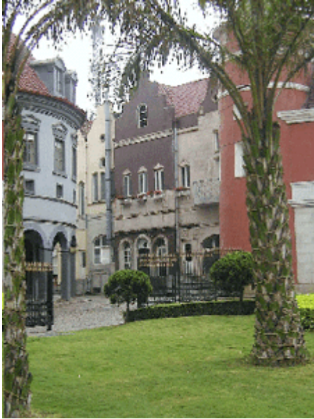
Fig. 23 : European urban fiction in Shenzhen.

Theme parks are exceptionally popular in China. They reflect a curiosity in things, which in its intensity can only be interpreted as the radical negation of previous isolation, an isolation that was less total as portrayed many times in this country, but which is lived out as a collective trauma. There shall never be isolationism again ! Thus everything that the world has to offer in terms of the beautiful, phenomenal, strange, fairy-tale-like, impressive, unmistakable, etc. is photographed, scanned, copied, transposed to China, built anew true to scale or miniaturized, and viewed with astonished eyes. According to estimates there are about 1,000 theme parks in China (Sheng, Haitao 2007). Capital city of these is without a doubt the boom town Shenzhen. Already in 1989 the first miniature landscape park, named ‘Splendorous China’, was opened here. The incomparable success of this park triggered the theme park boom, which turned China into the world champion of fictional worlds.