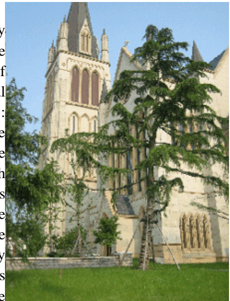
Fig. 15 : Copy of a cathedral, Taiwushi.