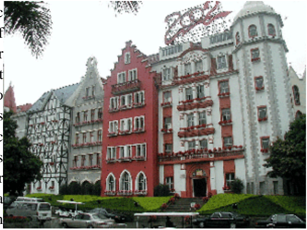
Fig. 24 : European urban fiction in Shenzhen.

With the above reference to the historic framework of conditions for the popularity of theme parks in China we balance the demand for validity of a general theory of entertainment spaces (worlds of experience), according to which these in general need to be viewed as reaction to the functionalism of classic modernism. The Chinese example teaches us that cultural factors and the particular developmental conditions of a country play a large role in the evaluation of urban aestheticizations. The simplified transfer of citytainment to Postmodernism or Second Modernism remains, as singular explanatory approach, below par in terms of complexity.