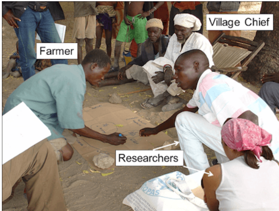
Figure 1 – Interpreters involved in community sketching at the village of Monko, Benin (F. Burini, 2010).

The sketch map is accomplished by leaving the participants at the assembly free to use a perspective or zenithal view and the use of abstract or figurative symbols distributed in a way which is similar to reality, leaving out any pretence to accuracy and precision of distances: the data represented refers to quantitative and qualitative information gained from the knowledge and experience of the community which produces the map, and refers to the problem identified.